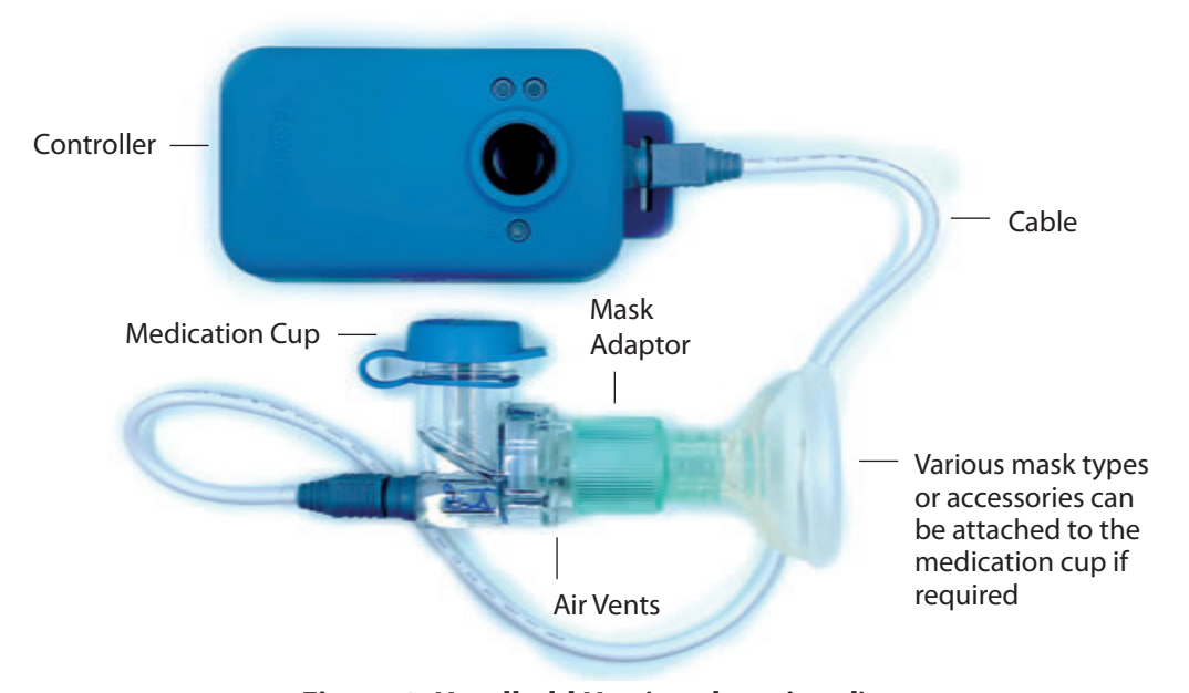
Figure 1: Handheld Use (mask optional)