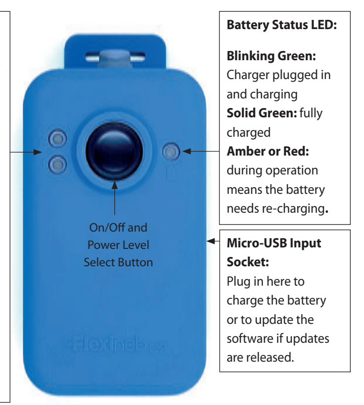
Figure 3: C2 Controller

Off: Indicates an open circuit somewhere or an internal error. Check all connections.