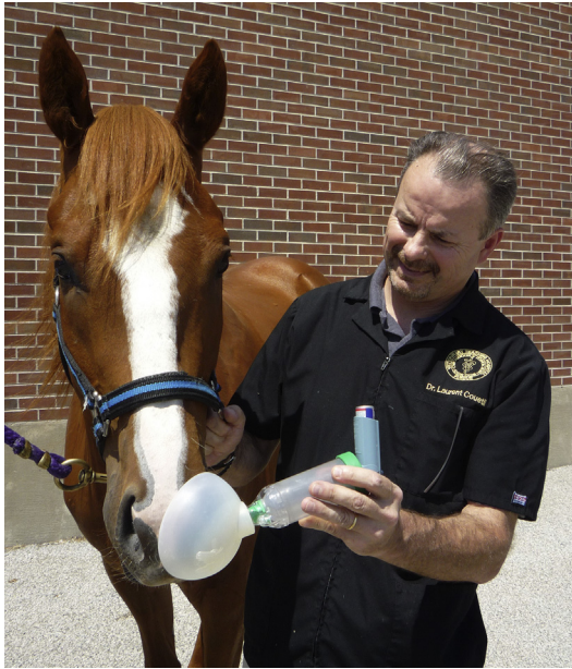
Fig. 3. Aerohippus Equine Aerosol Chamber: The handheld, single-nostril mask is connected to a small cylindrical chamber, and the pMDI is inserted into the opposite end. On actuation of the pMDI, the suspended aerosols remain in the chamber until the horse inspires. (Trudell Medical, Inc, London, ON.)