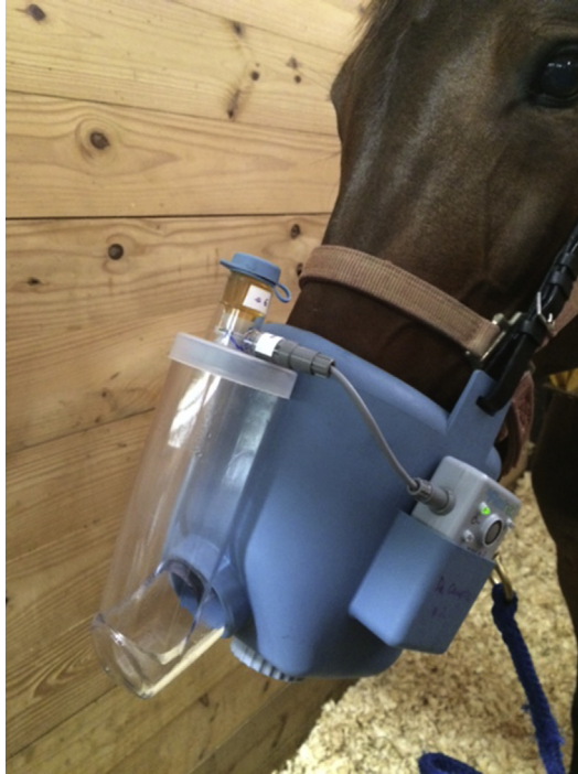
Fig. 5. Flexineb Equine Nebulizer: The fitted mask is placed on the horse's muzzle, such that both nostrils are exposed to the system, and the mask is strapped behind the horse's ears. The mask is connected to a vertical cylindrical chamber, to which the solution to be nebulized is added. (Flexineb, Inc, Union City, TN. Courtesy of Dr Laurent Couetil, West Lafayette, IN. )

is attached to the side of the mask. This mask can also be adapted for use with pMDIs.