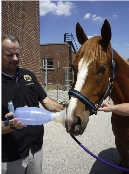
Fig. 2. Equine Haler: The handheld, single-nostril mask is connected to a large ellipsoid chamber, and the pMDI is inserted into the opposite end. On actuation of the pMDI, the suspended aerosols remain in the chamber until the horse inspires. (Jorgensen Laboratories, Loveland, CO. )

The studies mentioned earlier were completed using different propellants, drugs, and amounts of drug per actuation; therefore, the 2 studies cannot be directly compared. In a direct comparison between the AeroHippus and the Equine Haler as devices for the delivery of albuterol with the same propellant, at the same dose, similar improvements in clinical scores and pulmonary function were reported. 15 However, this study did not evaluate drug deposition. Nonetheless, it was concluded that both devices effectively delivered the bronchodilator albuterol and reversed the abnormalities associated with airway obstruction. 15 With either of the single-nostril devices, it is recommended to occlude the contralateral nostril temporarily in order to optimize deposition.